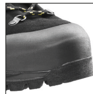
Rubber toe and heel protection