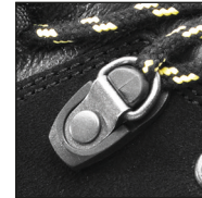
HAIX® 2-Zone Lacing