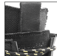
Double tongue for excellent pressure distribution and adjustment