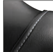
RTC with countersunk seams