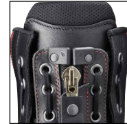
HAIX® Lacing System