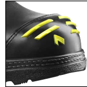
HAIX® High Durability Cap System