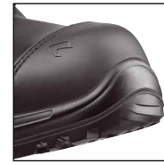
HAIX® Composite Toe Cap