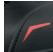
RTC with countersunk seams