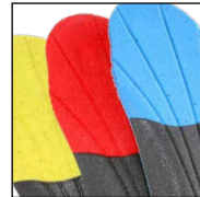
Vario Wide Fit System