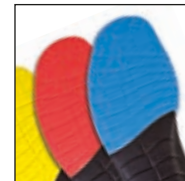
Vario Wide Fit System