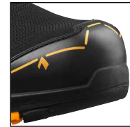
HAIX® Composite Toe Cap