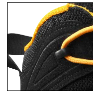
HAIX® Climate System