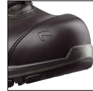
HAIX® Composite Toe Cap