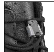
HAIX® Smart Lacing