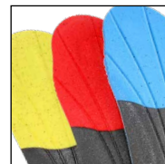
Vario Wide Fit System