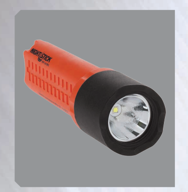
High-efficiency deep parabolic reflector