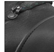
RTC with countersunk seams