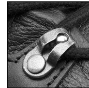
Smooth running lacing elements