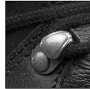
HAIX® 2-Zone Lacing